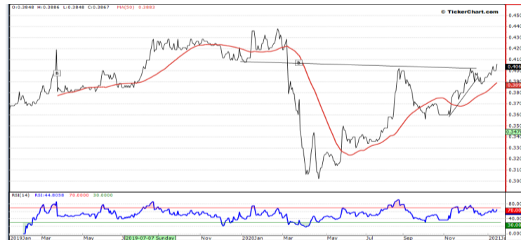
Support, Resistance and Target levels for U Capital OMAN 20 INDEX Co. - Weekly Basis

In line with our technical analysis, the stock now in upward trend and the rectangle indicator will be complete after crossing a resistance level of OMR 0.400. The level of RSI below 30 points. The stock already cross the MA50, but if the stock comes out this channel, the target price will be at OMR 0.416.